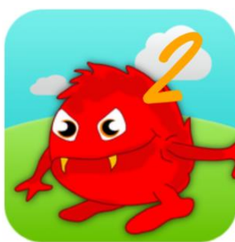
Monster Phonics Learn to Spell the Next 200 High-Frequency Words