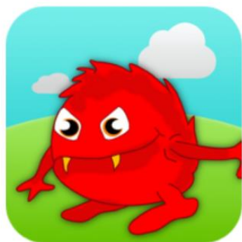
Monster Phonics Learn to Spell the First 100 High-Frequency Words

Monster Phonics products are listed as effective multi-sensory phonics resources by the Department for Education, UK. The app supports the reading and spelling of high-frequency words and is part of a wider phonics scheme that supports the New Curriculum for Spelling (KS1) and phonics in Reception. Monster Phonics Apps have been developed specifically to make phonics more accessible for all learners. Read more about how Monster Phonics works.