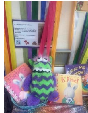
Wilbur the Worry