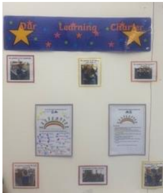
Our Learning Charter Monster

'Together we shine and reach for the stars'