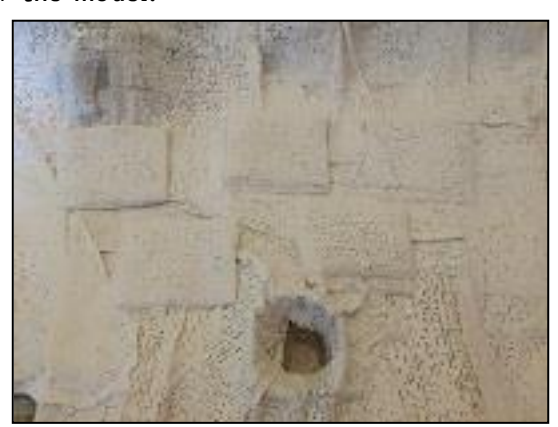
\hbox{@ Original resource copyright Hamilton Trust, who give permission for it to be adapted as wished by individual users.}