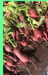
Plant B – Radish