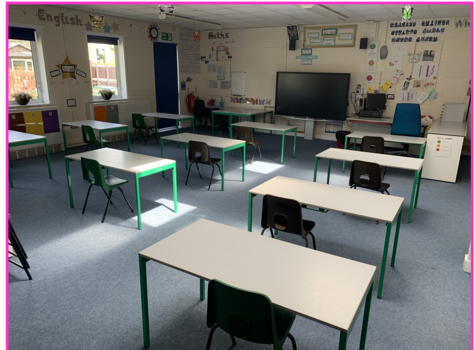
You will be in the Butterflies classroom