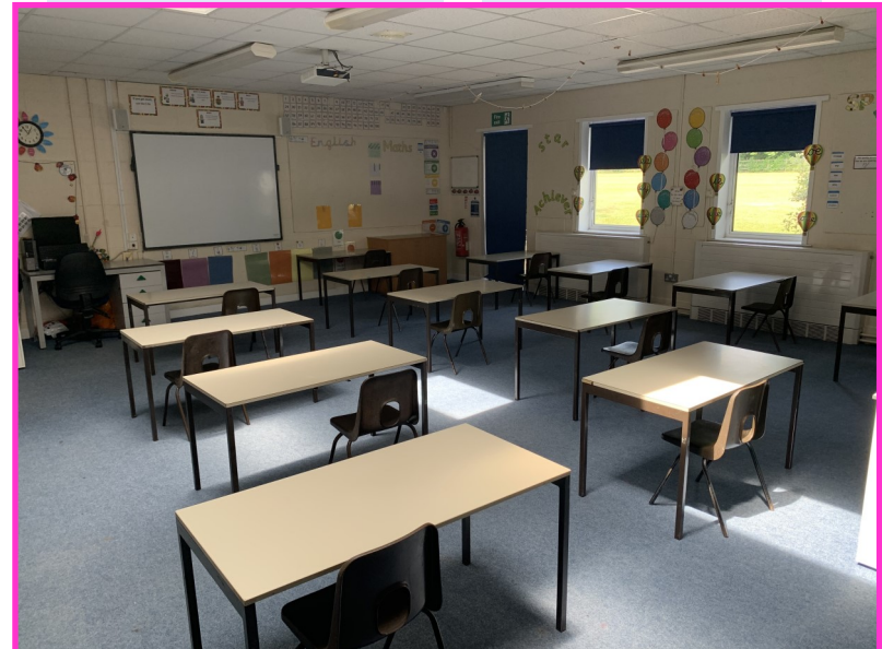
You will be in the Ladybirds classroom