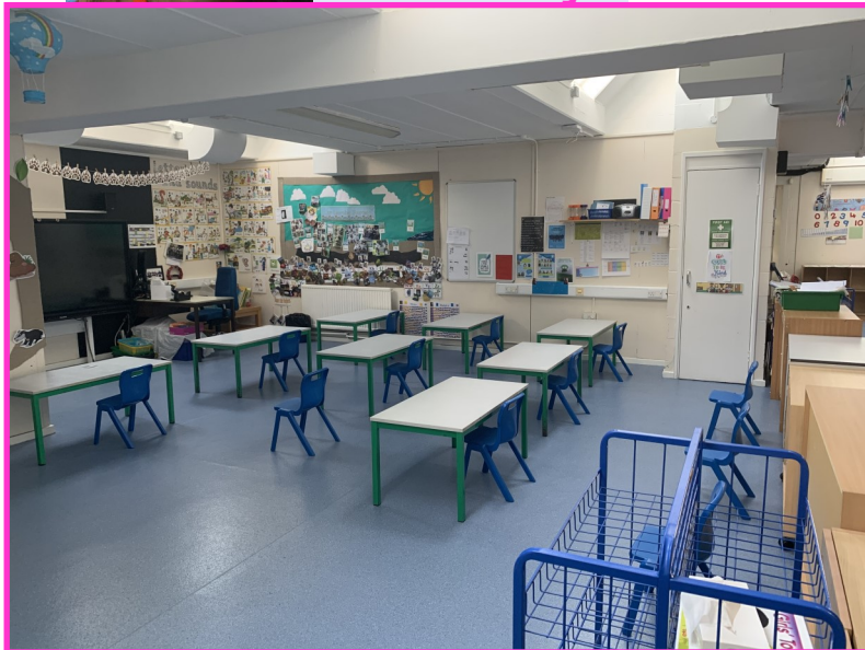
You will be in the Badgers classroom