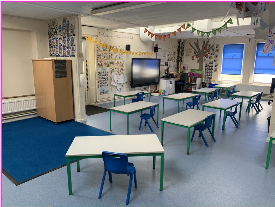
You will be in the Rabbits classroom