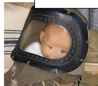
Baby gas mask