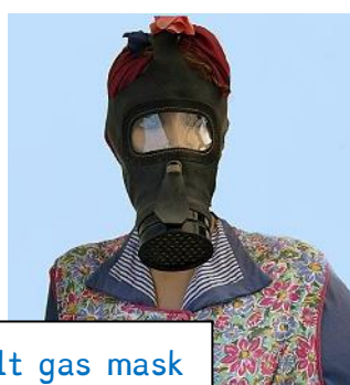
Adult gas mask