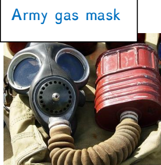
Army gas mask