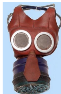
Child's "Mickey Mouse" mask