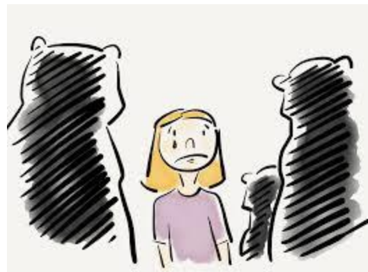
Sad looking Goldilocks apologises to the bears.

The suspect has since been named as Goldilocks. She is said to be very sorry for her actions. "I was lost and very hungry. I promise that I will make it up to Baby Bear."