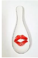
lipstick on spoon