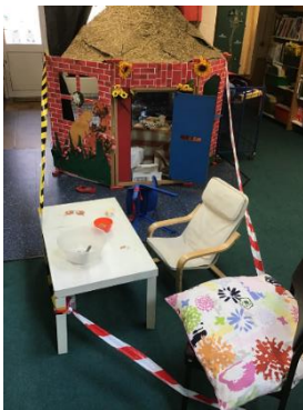
Devastation at the crime scene.

Last night at 5pm, Baby Bear's porridge was stolen from Godinton Primary School. CCTV footage caught the suspect red-handed and she also left behind a few clues!